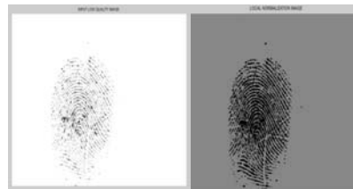
Fig.2 Normalized Images

We define a reference point as the point of the maximum curvature on the convex ridge [10] which is either a core singular point or a point with the maximum [44] curvature on the convex ridge if an image does not have a core point. If core points exist in a fingerprint, the core point on the convex ridge becomes a reference point. In case a fingerprint has two core points, one can automatically be selected as a reference point if it has a larger curvature than the other.